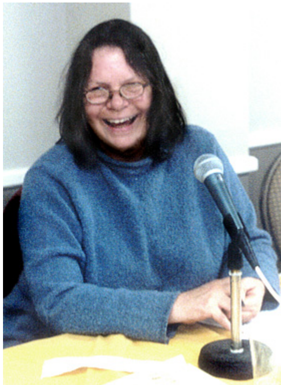
iPNB meeting March 7-9, 2003